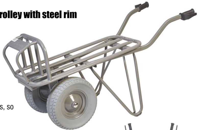
18351 M-230-CT WB 2WI UNIPRO

Equipped with Extra wide puncture proof PU-tyres.